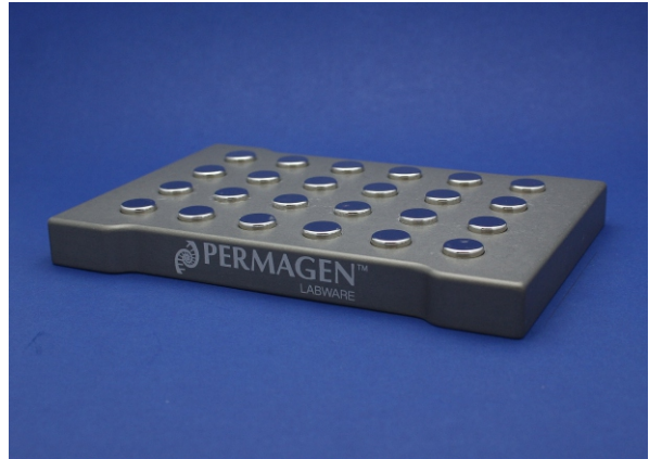
96- Well Low Elution Magnetic Separation Plate