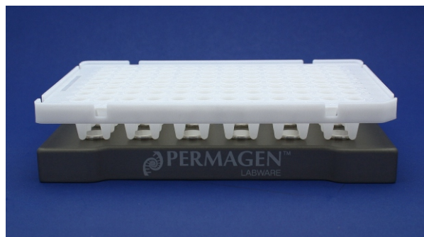
Compatible with many 96- Well PCR plates