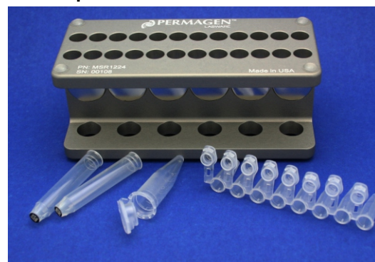
One rack, several options