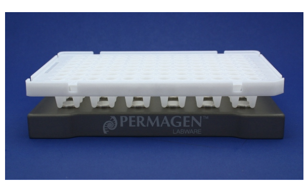
Compatible with many 96- Well PCR plates

Permagen Labware, LTD. • 300 Andover Street • Suite 169 • Peabody, MA 01960 • P: 978.914.4943