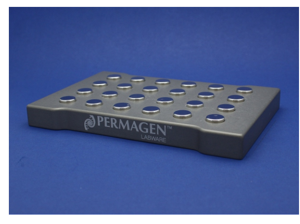
96- Well Low Elution Magnetic Separation Plate