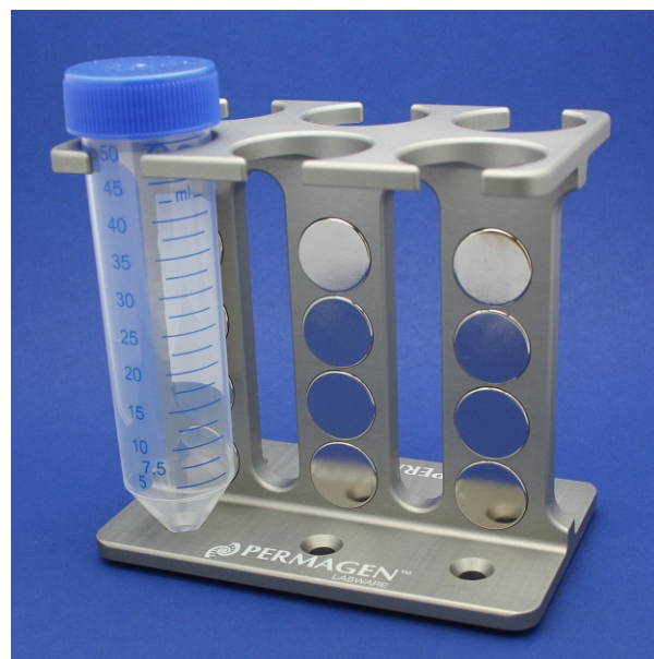
MSR6X50 – 6 X 50 mL Rack

For more information please visit our website or email us at info@permagenlabware.com