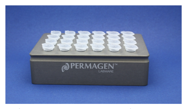
Compatible with many microfuge tubes and screw cap tubes