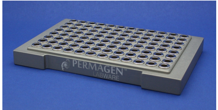
M series 96- Well Magnetic Separation Plate

For more information please visit our website or email us at info@permagenlabware.com